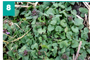
Red dead nettle